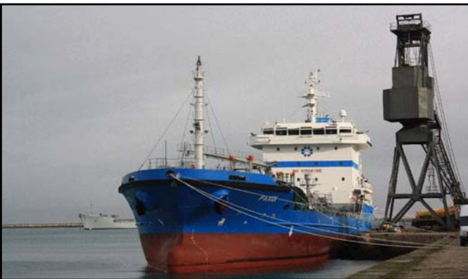
New Barge ‘Paxoi’

Bunkering in Portland is conducted by modern double-hull supplying vessels, 24 hours a day, 7 days per week. The local service centre ‘Portland Bunkers International Ltd’ provides technical and logistics support to operators.