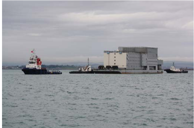
Jascon 27 departing Portland for West Africa

The 3,000 mile voyage is set to take 21 days, pending no delays en route!